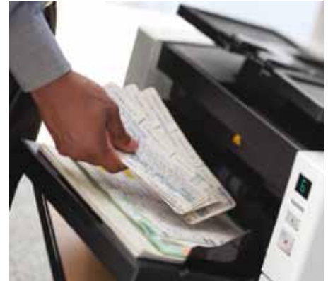
SurePath Paper Handling automatically adjusts for a variety of document sizes and thicknesses.

Smallest scanner in its class to offer a 500-sheet input capacity.