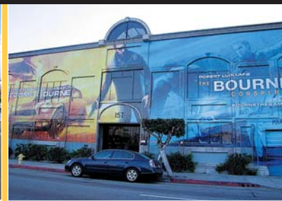
Artwork &amp; Graphics