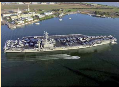
Aeronautics &amp; Naval Architecture