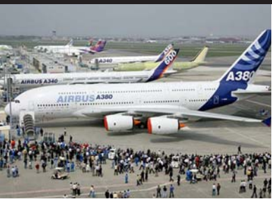
Aerospace and Satellite Imaging